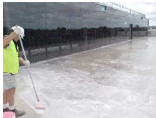
Figure 1 Applying epoxy primer

Gently stir. Do not allow bubbles to form in the pail. Product can be applied by roller or by brush. At least two coats are required to achieve the necessary dry film thickness. Recoat up to 4 hours at 25°C. The required final dry film coat thickness is 750 microns to 1mm utilising 1.5 litres of product per m2. Thicker applications can be undertaken.